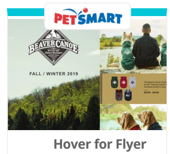
Hover for Flyer