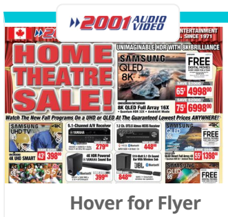
Hover for Flyer