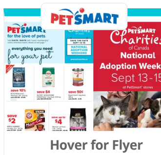
Hover for Flyer